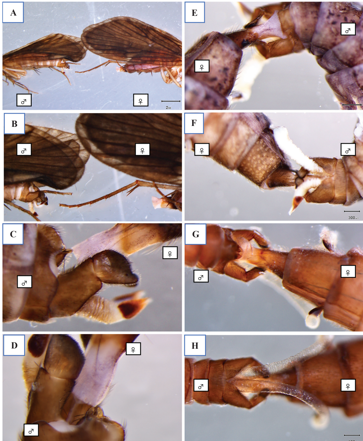
Figure 2. Four mating states of a pair of R. lezevi (after completing the mating turn). A, B. State A; C, D. State B; E, F. State C; G, H. State D. Lateral view; A–C. Dorsal view; E, G. Ventral view; F, H. Male, inverted, lateral, obliquely from above; D, C–H. Wings have been removed.

inwards, but not closed. State B (one of the seven pairs) was defined when the pair was fixed in the mating state (Fig. 2C, D). Female VIII and IX segments were elongated and directed medially towards the male copulatory organs. Male parameres were elongated, but remained in a state similar to State A. However, they did not contact