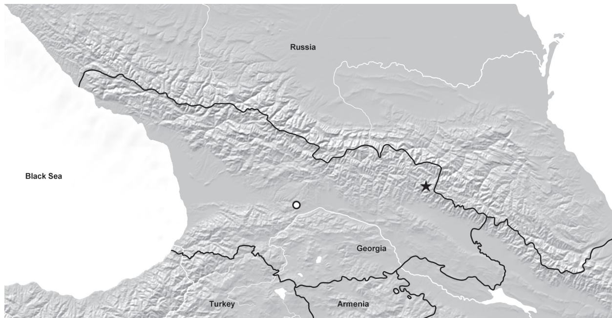
Map 1: Distributions of Tectusa species in the Caucasus region: Tectusa abanona (black star); " T. " caucasica (white circle).

posterior margin of tergite VII without palisade fringe; tergite VIII with broadly convex posterior margin.